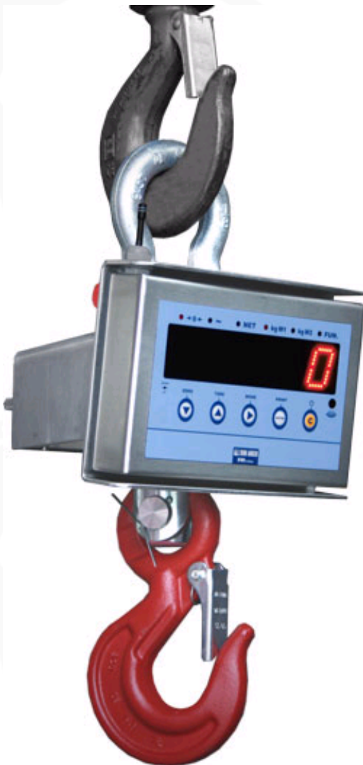
MCWK: Crane scale in IP67 STAINLESS STEEL.